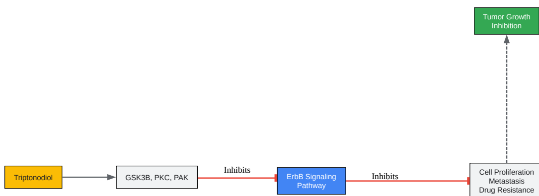
Proposed Mechanism of Triptonodiol

By acting on these targets, Triptonodiol is believed to inhibit the ErbB signaling pathway, which plays a crucial role in tumor cell proliferation and survival.[3][4][5] Furthermore, Triptonodiol has been observed to induce autophagy, a cellular process that can, in some contexts, suppress tumor invasion.[1][2][6]