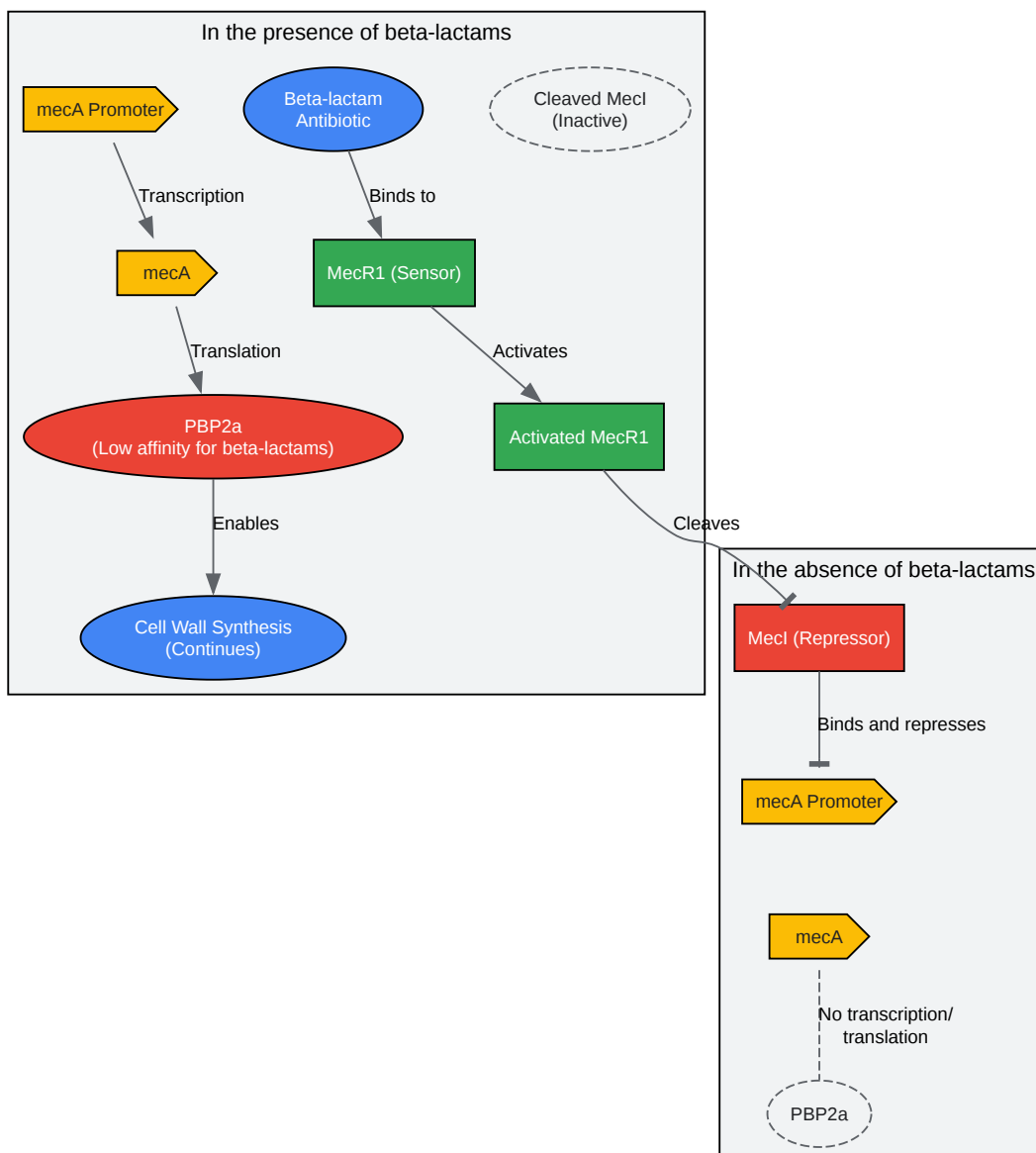
Simplified Regulatory Pathway of mecA Expression

Click to download full resolution via product page