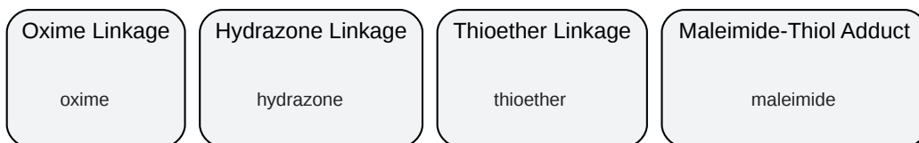
Chemical Structures of Common Bioconjugation Linkages

Click to download full resolution via product page