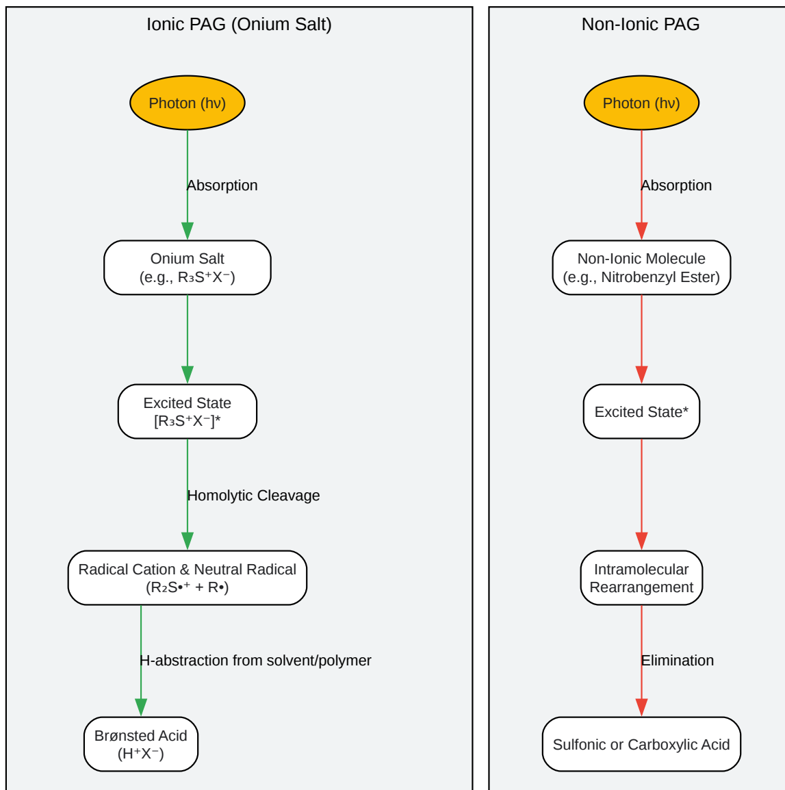
Figure 1. Acid Generation Mechanisms

Click to download full resolution via product page