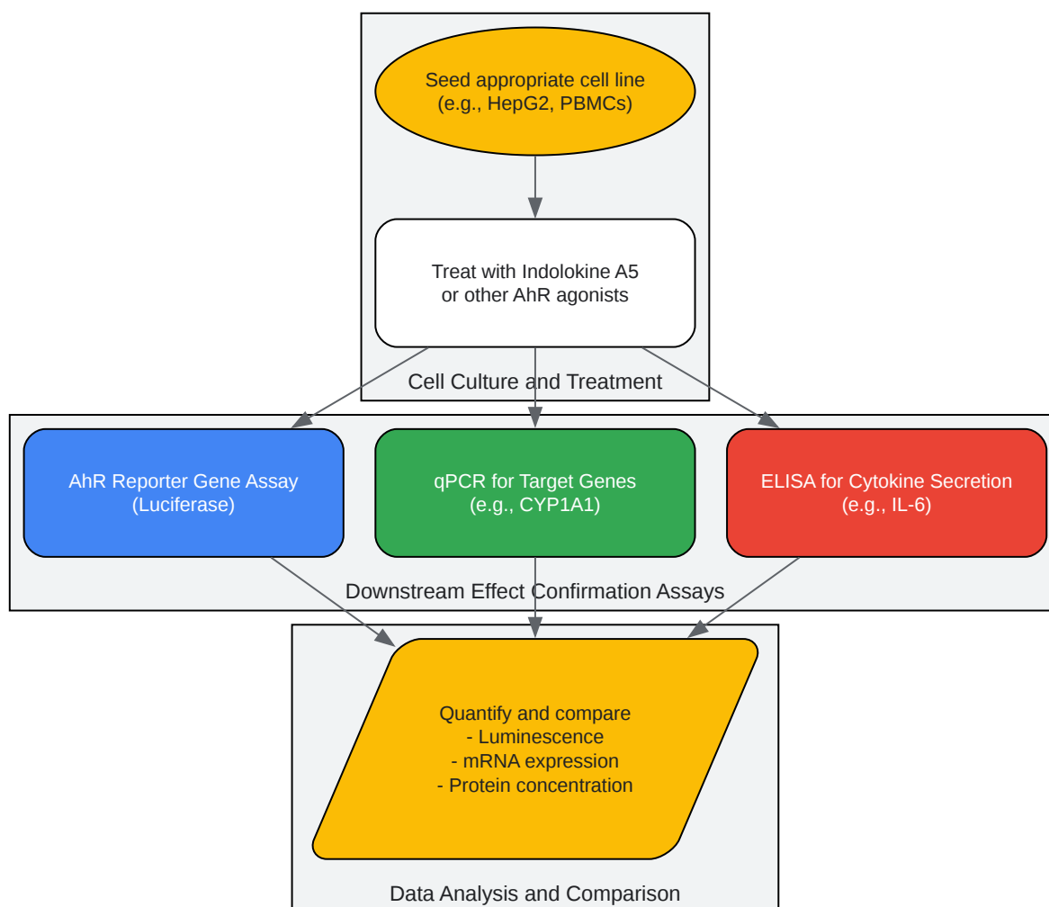
Figure 2: Experimental Workflow for Confirmation

Click to download full resolution via product page