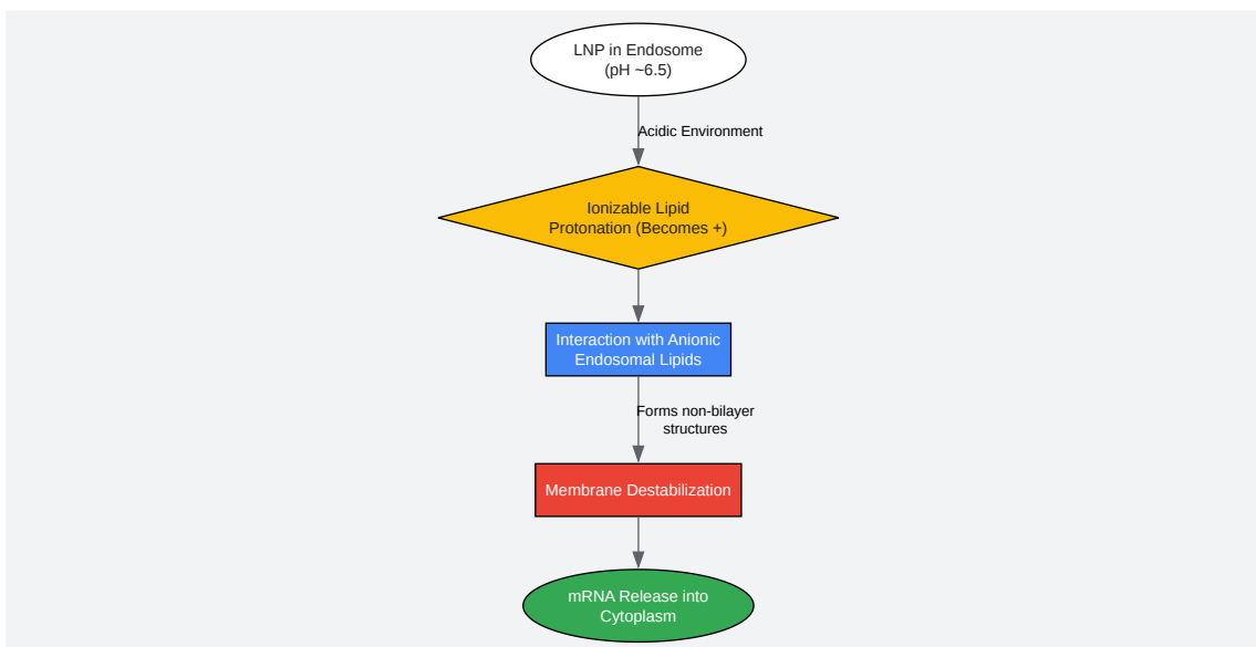
Mechanism of Endosomal Escape for Ionizable Lipids