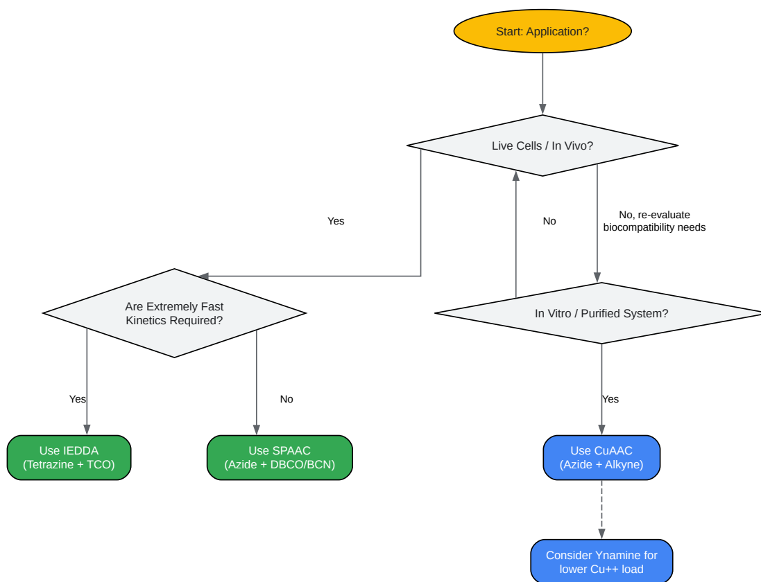
Decision Guide for Selecting a Bioconjugation Reagent

Choosing the right bioconjugation chemistry is critical for experimental success. The following decision tree provides a logical guide for selecting an appropriate reagent.