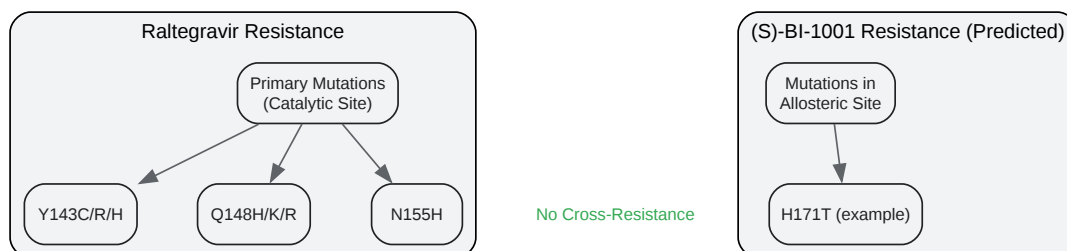
Figure 2. Resistance Mutation Pathways

Click to download full resolution via product page