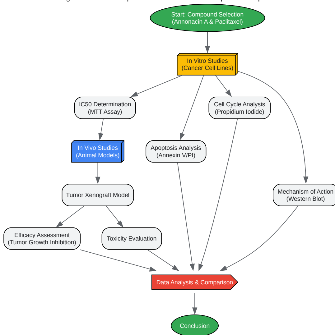
Figure 2. General Experimental Workflow for Compound Comparison

Click to download full resolution via product page