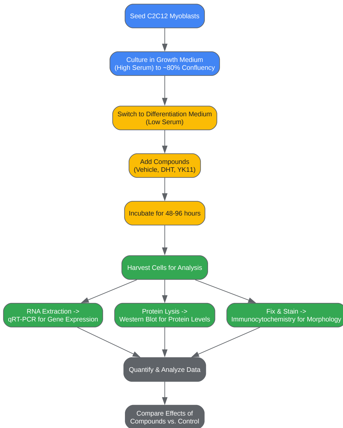
Standard Workflow for In Vitro Myogenesis Assay

Click to download full resolution via product page