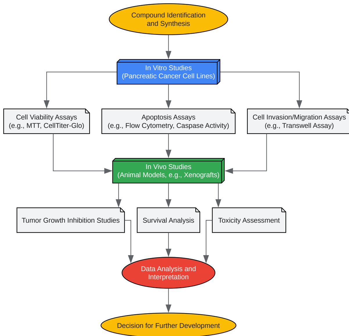
General Workflow for Preclinical Evaluation of an Anti-Cancer Agent

Click to download full resolution via product page