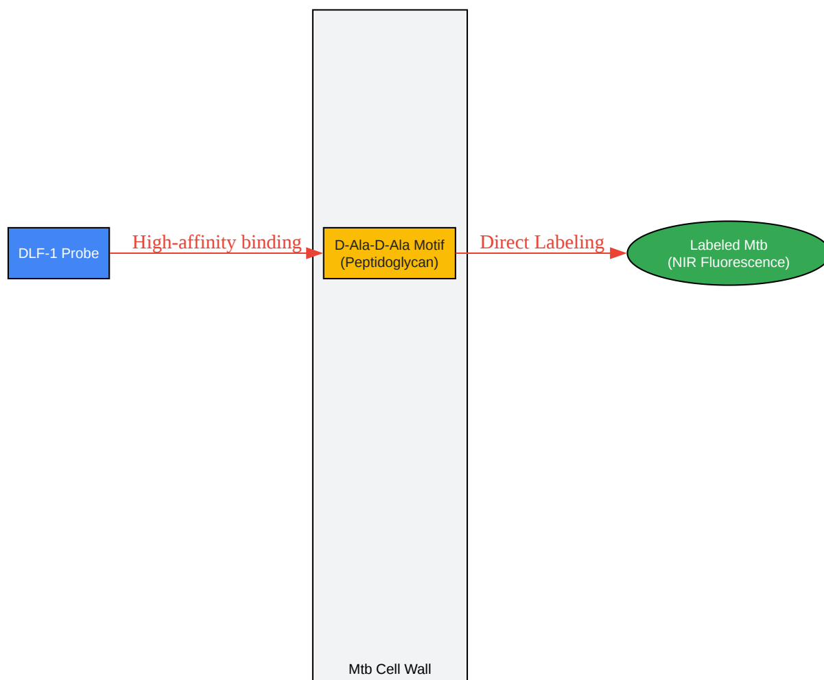
DLF-1 Binding Mechanism

Click to download full resolution via product page