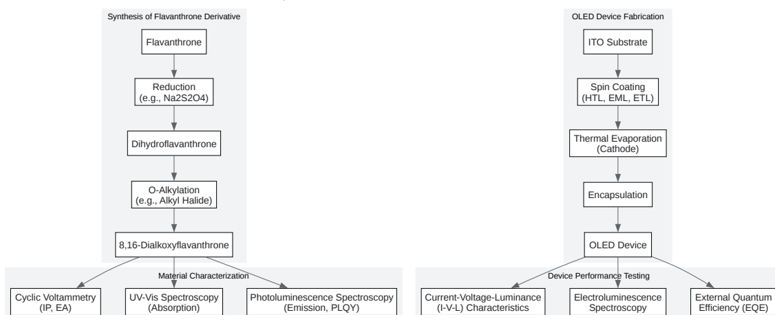
Experimental Workflow for OLED Fabrication and Characterization