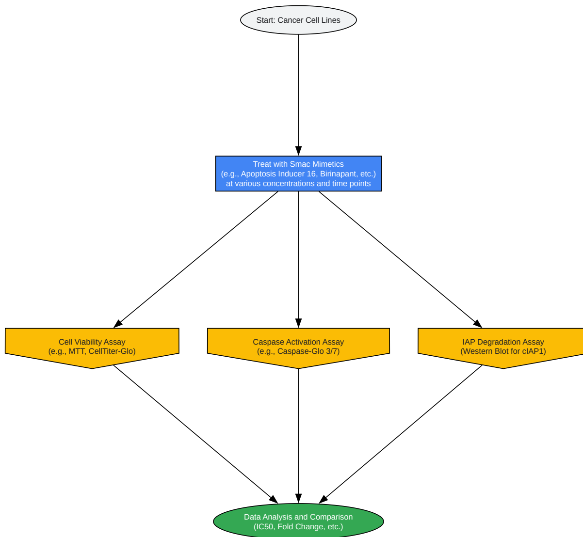
General Experimental Workflow for Comparing Smac Mimetics

Click to download full resolution via product page