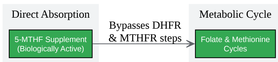
Diagram 2: Direct Utilization of 5-Methyltetrahydrofolate

Click to download full resolution via product page