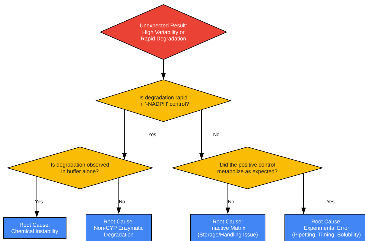
Diagram 2: Troubleshooting Logic for Unexpected Degradation

Click to download full resolution via product page