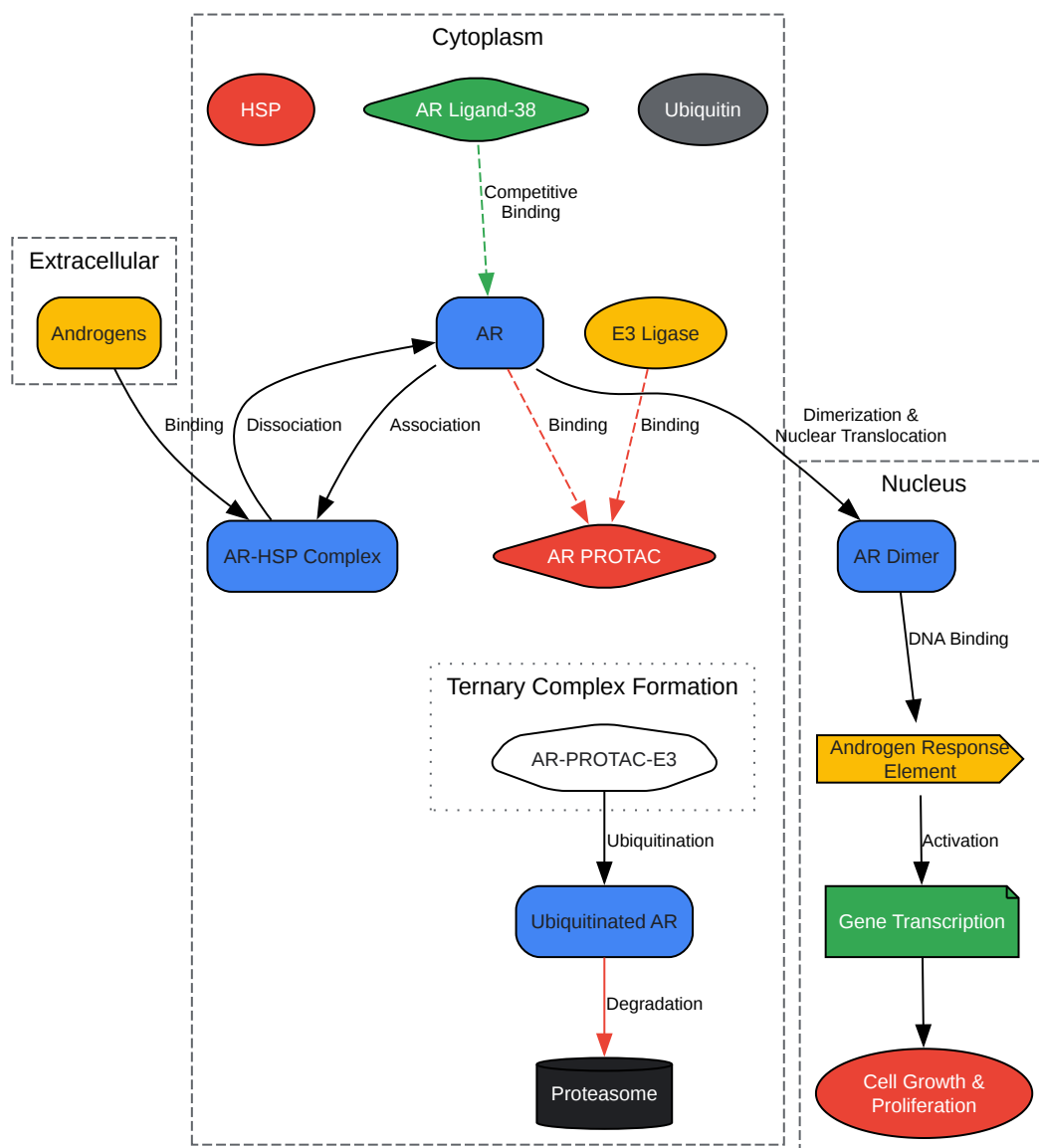
Figure 1: Androgen Receptor Signaling and Points of Intervention

Click to download full resolution via product page