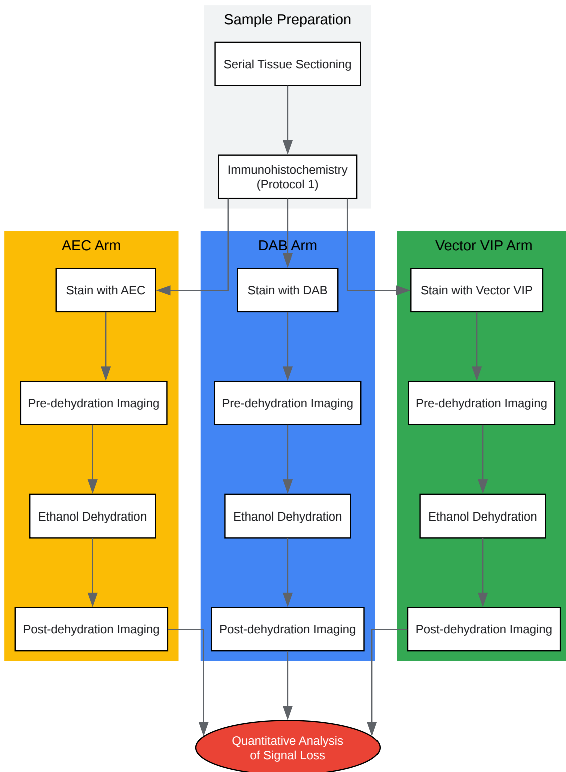
Chromogen Stability Comparison Workflow

This diagram outlines the workflow for the comparative analysis of chromogen stability.