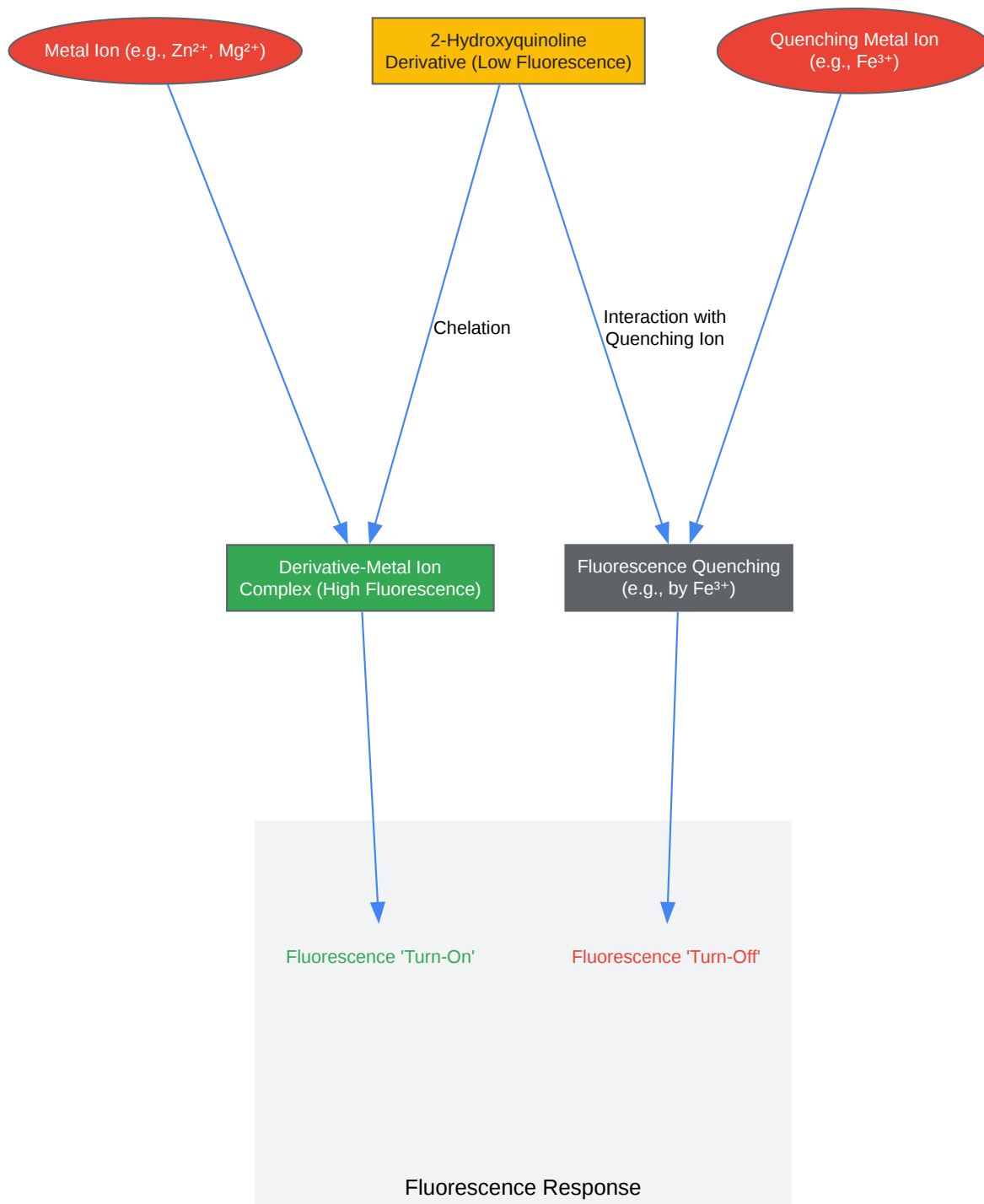
Figure 1. Signaling Pathway for Metal Ion Detection

Click to download full resolution via product page