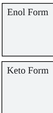
Structures of Isobutyl Acetoacetate Tautomers